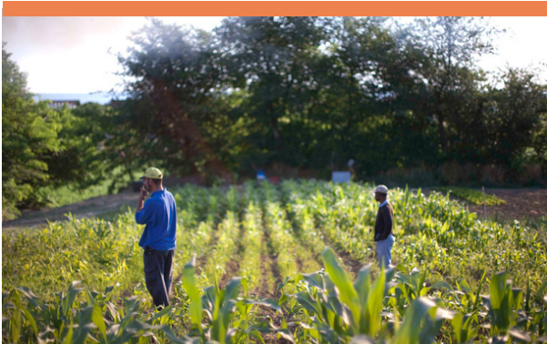
Activities in the Solidarity Garden