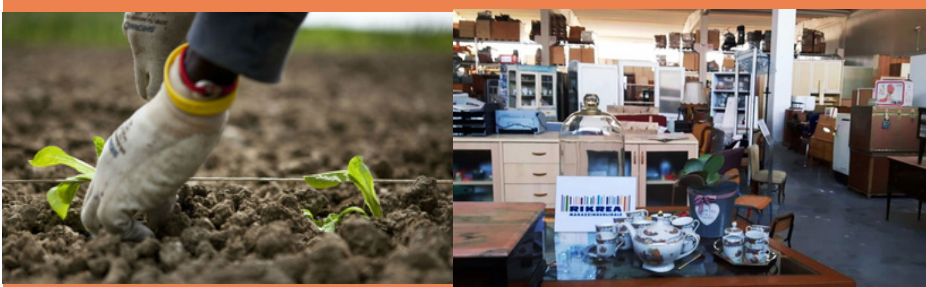
Activities in the Solidarity Garden