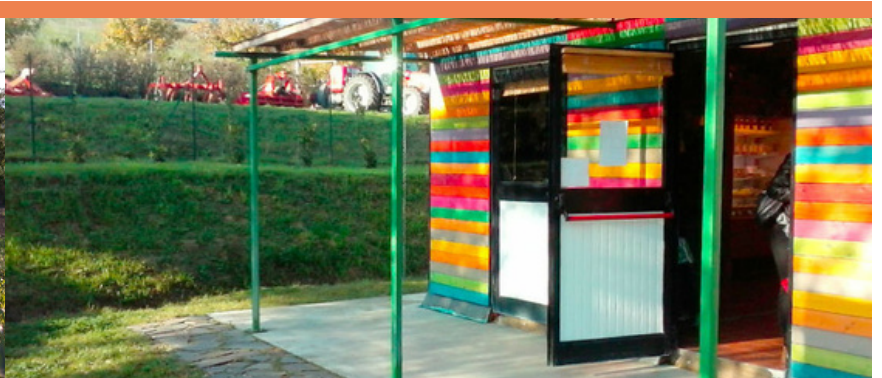
One of the buildings of Undicesimaora